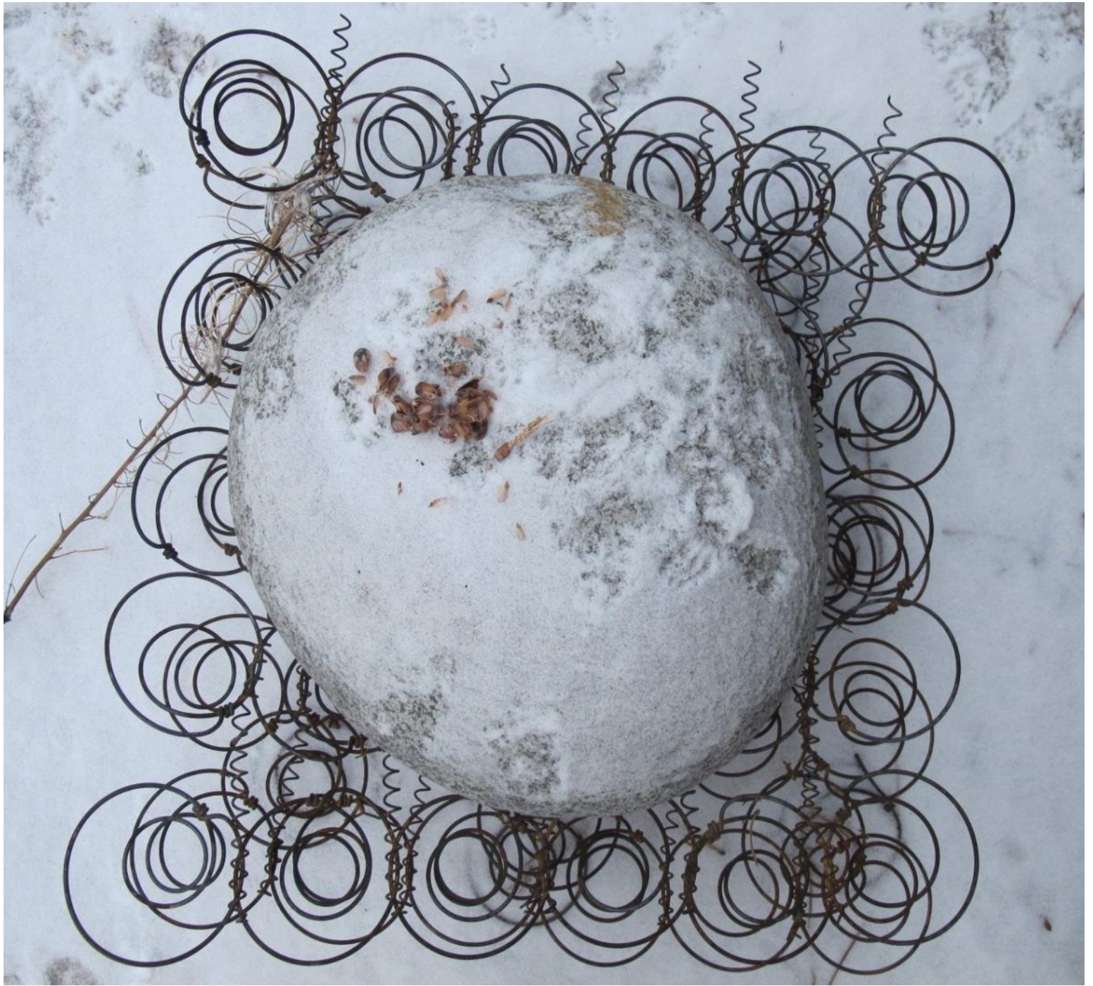
Scott Price, Stone Bed , 2019