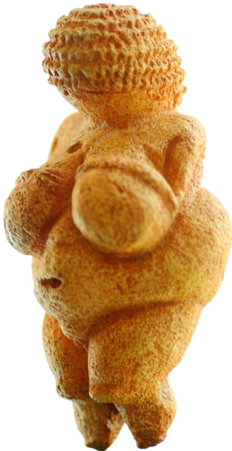
Venus of Willendorf

We can't manifest this destiny alone and to all of you who have felt alone, disconnected and disenfranchised please know there is a community here waiting for you with open arms, a safe and inclusive place where you can come and be yourself. For as long as our species has possessed free thought and an opposable thumb we have known of the transformative power of art in our lives. While we may never know the story behind the Venus of Willendorf , an 11.1-centimetre-tall (4.4 in) Venus figurine estimated to have been made around 25,000-30,000 years ago - its power still resonates to this day.